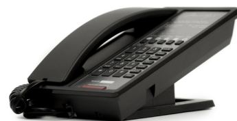
3.5 in (H)

Click on any image to be directed to our website.